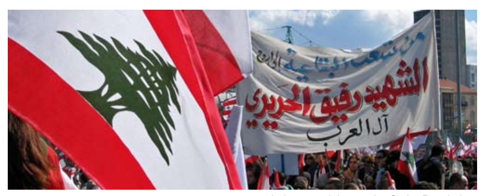
Lebanon celebrates the Cedar Revolution.