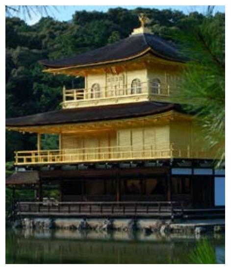
Kinkakuji Temple in Japan

I'm based in Tokyo for this year, working on my doctoral dissertation. Because I'm affiliated with the University of Tokyo and the Ohara Institute for Social Research at Hosei University, I have access to a wide range of research sources, plus the opportunity to meet leading scholars in my field. Indeed, the cutting-edge work in that field (20th-century Japan) mainly comes from Japan itself.